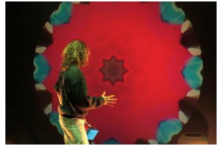
Figure 3: Player inside the Iamascope.

The Iamascope is an interactive, electronic kaleidoscope that combines computer, video, graphics and audio technology for participants to create striking imagery and sound [Fels and Mase, 1999]. In the installation, the players take the place of a colorful piece of floating glass inside a kaleidoscope, and simultaneously view a kaleidoscopic image of themselves on a large screen in real time. The Iamascope uses a single video camera as input at the base of the projection screen. Anything or anyone in front of the camera is captured and turned into a large kaleidoscopic image using multiple reflections of a small extract of the video image such as shown in figure 3. By applying image processing to the multicolored visuals, participants' body movements directly control music in parallel with changes to the image. The responsive nature of the whole system allows users to have an intimate, engaging, satisfying multimedia experience.